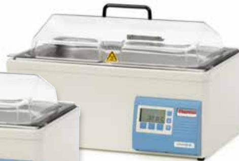
GP 28 Water Bath