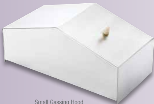
Small Gassing Hood