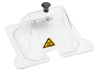
Polycarbonate Gable Cover