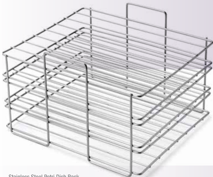
Stainless Steel Petri Dish Rack