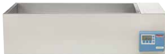
CIR 89 Water Bath