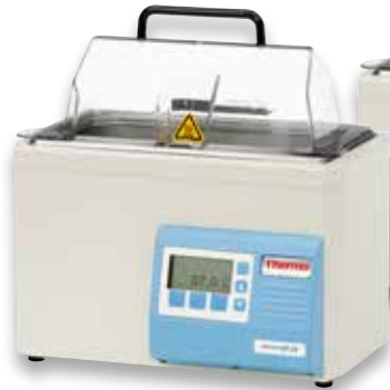
GP 2S Water Bath