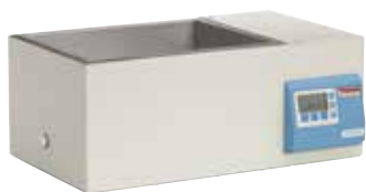
CIR 19 Water Bath