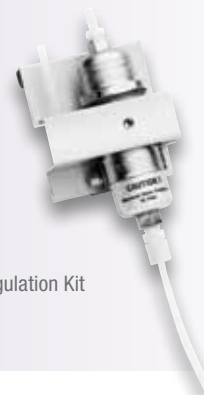
Water Regulation Kit