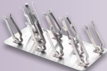
Test Tube Tray