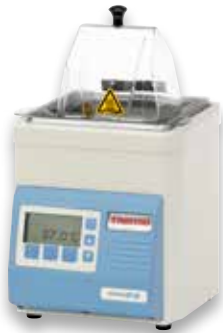
GP 02 Water Bath