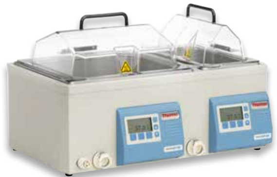
GP 15D Water Bath