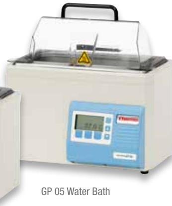
GP 05 Water Bath