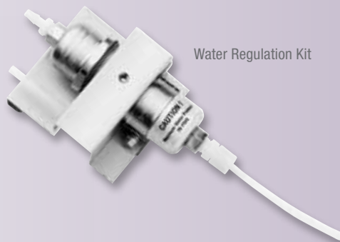
Water Regulation Kit