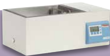
SWB 15S Water Bath