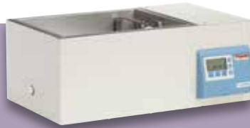
SWB 15 Water Bath