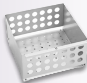
High Wall Tray