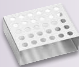
Microfuge Tube Rack