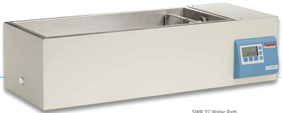
SWB 27 Water Bath