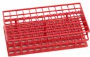
Nalgene Unwire Test Tube Full Rack