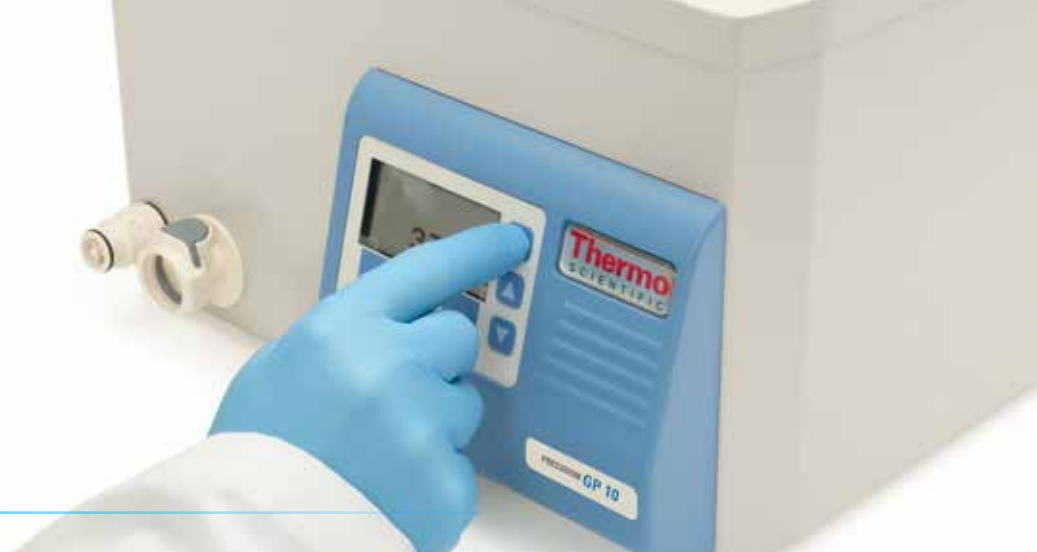
Thermo Scientific Precision Water Baths