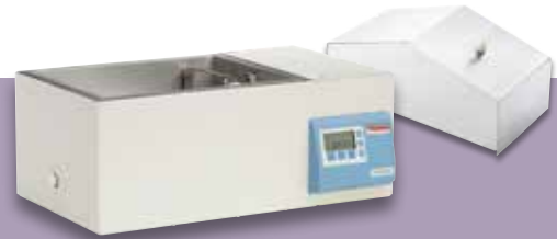
DUB 15 Water Bath