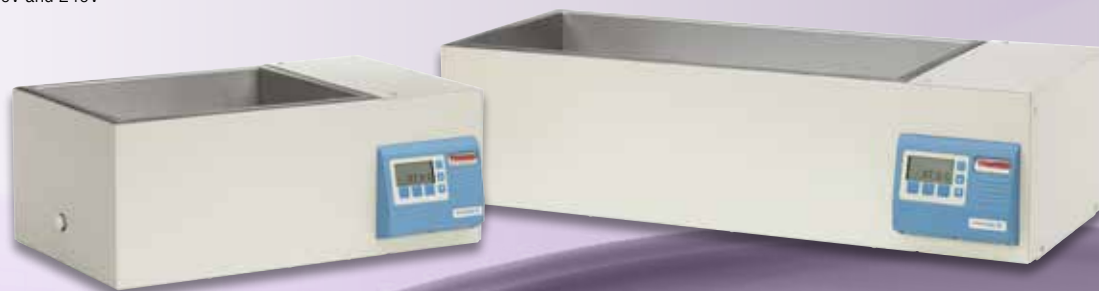
COL 35 Water Bath