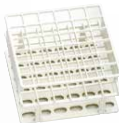
Nalgene Unwire Test Tube Half Rack