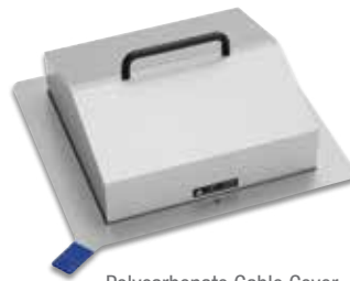
Polycarbonate Gable Cover