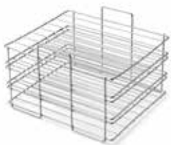
Stainless Steel Petri Dish Rack