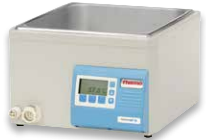
GP 10 Water Bath