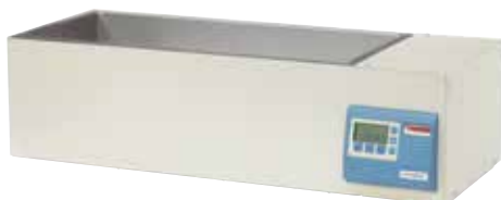
CIR 35 Water Bath